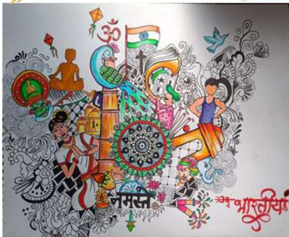
Shreya Singh X B