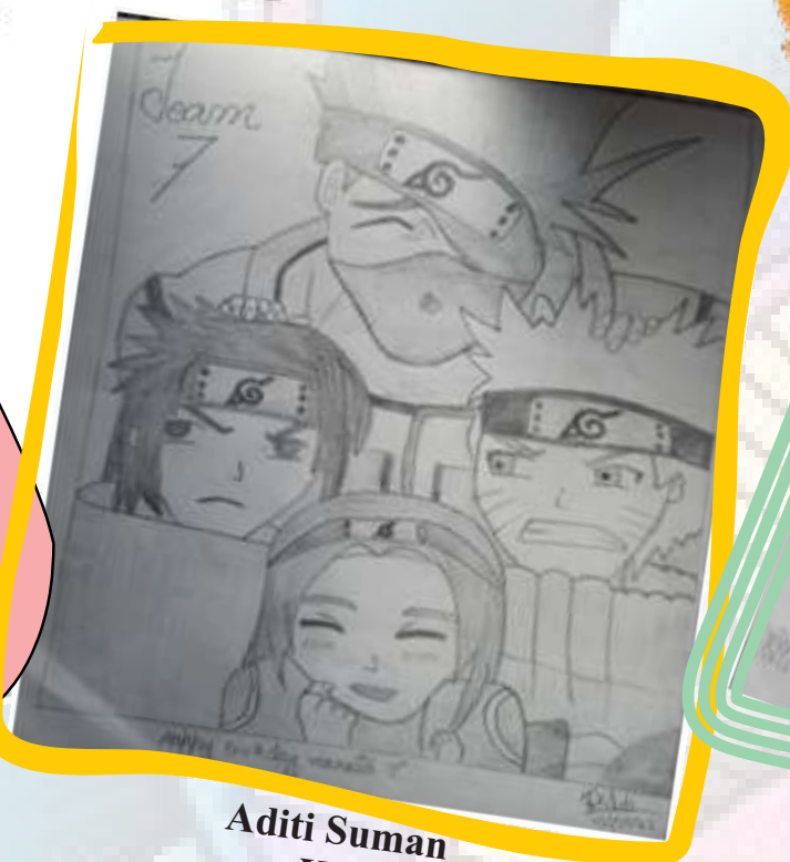
Aditi Suman X A