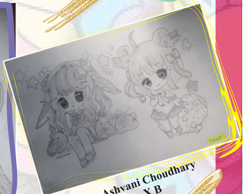
Ashvani Choudhary X B